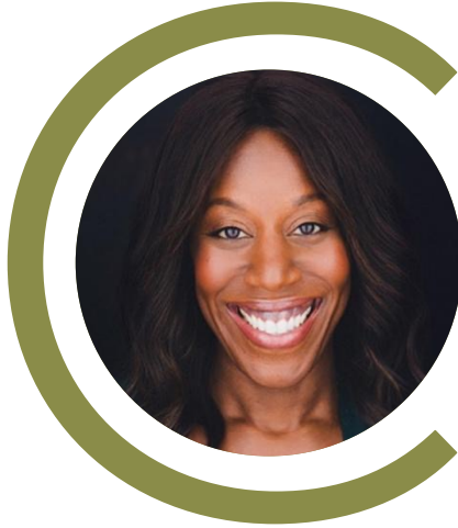
STORYTELLER 1: Leading with your heart