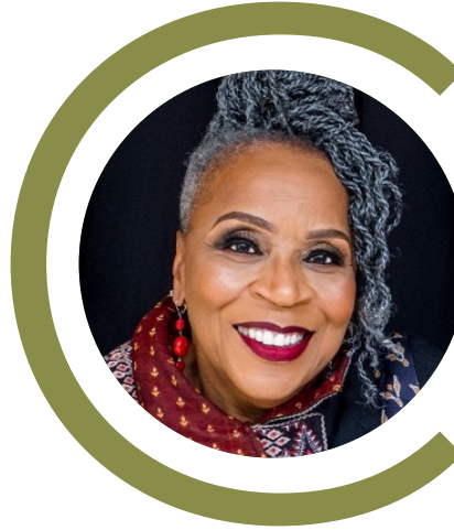
STORYTELLER 2: Leading for impact